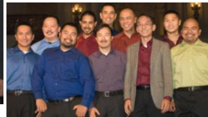
A men's choir sang a cappella at City Hall