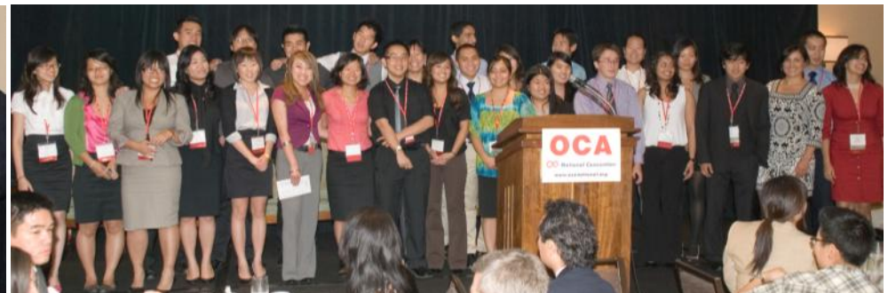
OCA Summer Internship Program recruited 29 college interns who were introduced at Youth Recognition Luncheon.