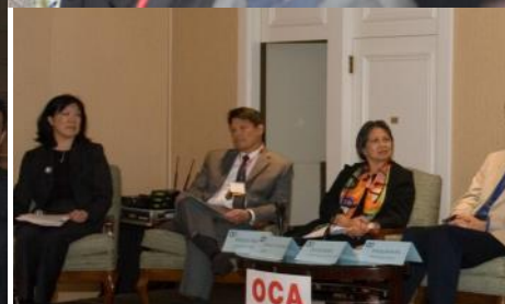
Panelists at one of numerous workshops