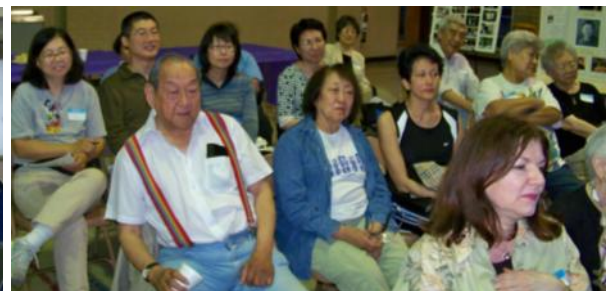
OCA-LI members listening at general meeting