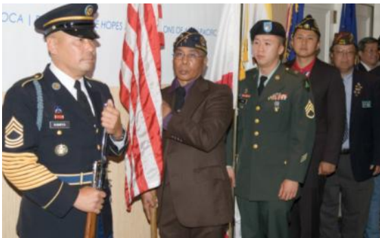
The local American Legion was honored at the Welcome Reception