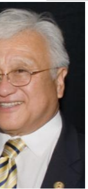
Congressman Mike Honda received Outstanding Achievement Award