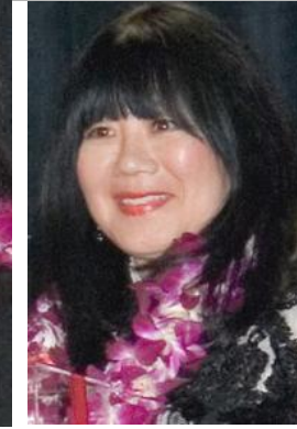
Anna Sui, famed fashion designer, received the OCA Pioneer Award