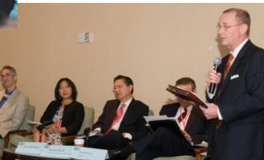
Call to Action: In Pursuit of Healthcare Reform