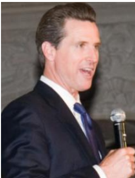
Top: Congresswoman Judy Chu, first Asian American woman elected to the House of Representatives, and Mayor of San Francisco, Gavin Newsom, address OCA members at City Hall.