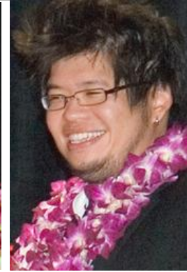
Steven Chen, co-founder of YouTube, received the OCA Pioneer Award