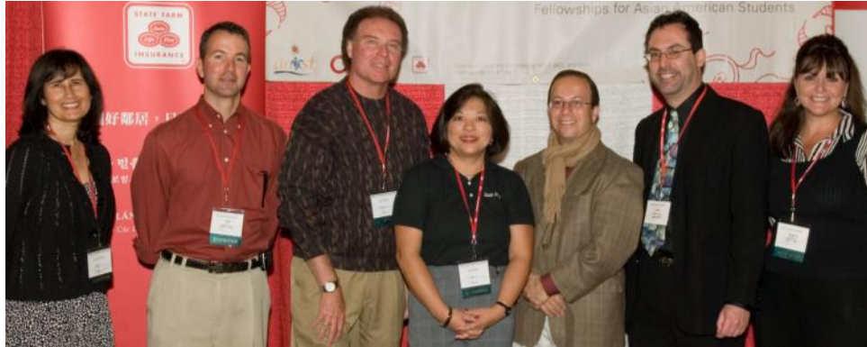
Representatives from State Farm had a booth at the convention. State Farm was the platinum sponsor of the Gala Banquet; UPS was the gold sponsor; and bronze sponsors were Kraft, US Postal Service, Comcast, & Harrah's Foundation.