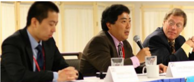
Speakers of the State of APA Summit focused on changing demographics of the APA community.