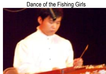
Hammered Dulcimer Player from China