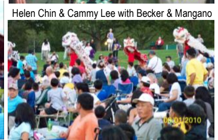
CCLI Lion Troupe arriving on the scene