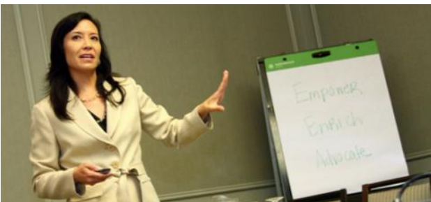
Chapter Advancement Track equipped OCA chapter leaders with tools to empower, enrich and advocate.