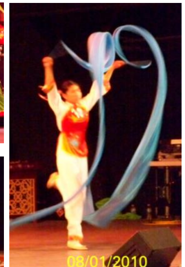
Ribbon Dance Finale