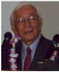
1st APA pro basketball player, Wat Misaka