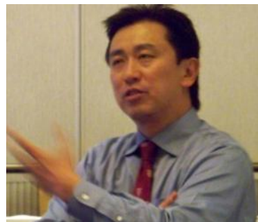
Workshop speaker discusses Secret Meaning of Body Language.