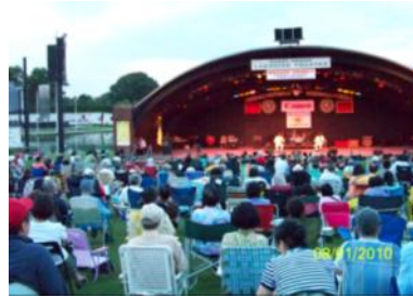
Viewers enjoying Cao Bao An Orchestra