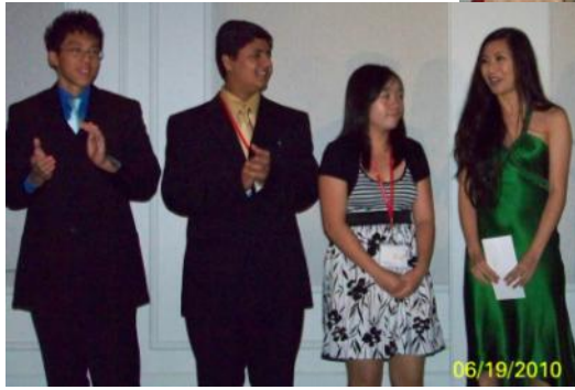
Recipients of the OCA-UPS Gold Mountain Scholarship at Gala