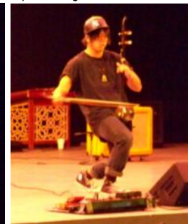
Hsu-Nami Rock Band Leader