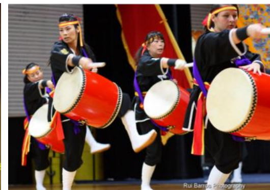
Taiko performers at Chinese Community Center