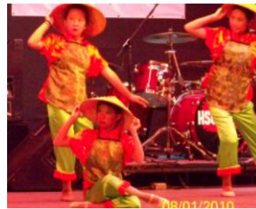
Dance of the Fishing Girls