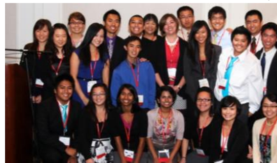
2010 OCA Summer Interns