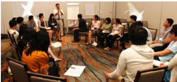
Youth and College Leadership Training developed skills to operate effectively in a diverse environment.