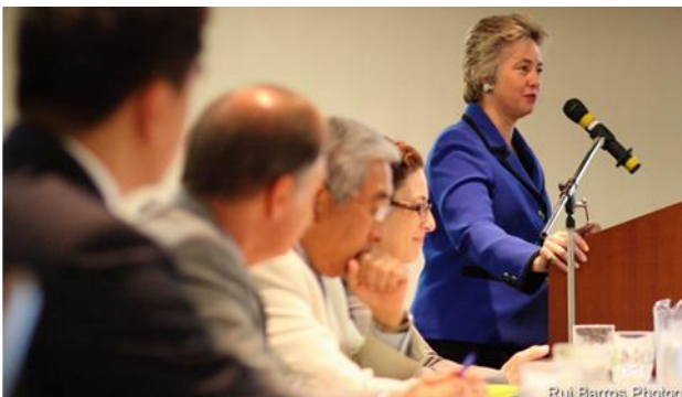
Mayor Annise Parker greeted attendees at the Opening Plenary: Green Energy, Green Economy.