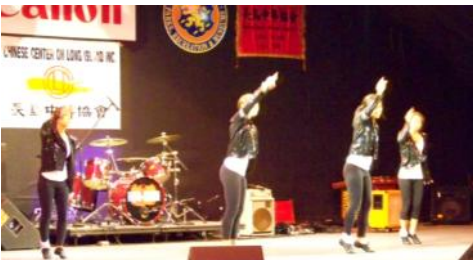
A Tribute to Michael Jackson: CCLI Dancers