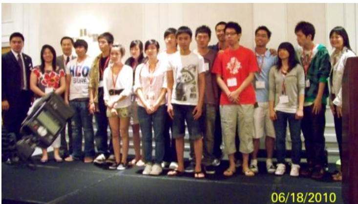
South Philadelphia HS students testified before school, city & state officials, raising concerns to violence faced by Asian immigrant students.