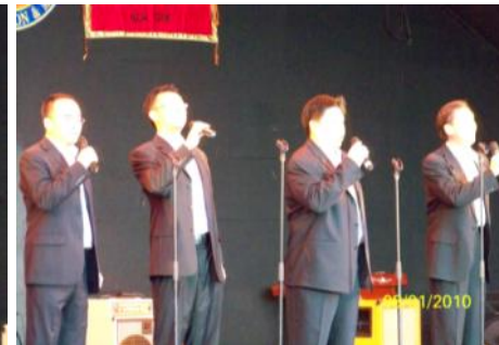
Heroes Male Quartet