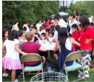
Children engaged in arts & crafts