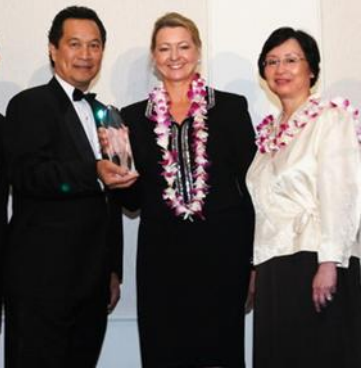
Presenters Corporate Achievement Award to AT&T.