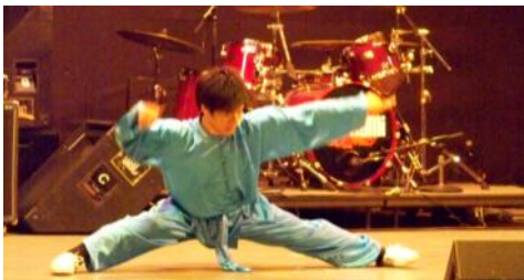
Modern Wushu Martial Arts Troupe Member