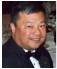
1st APA commander of Int'l Space Station, Dr. Leroy Chiao