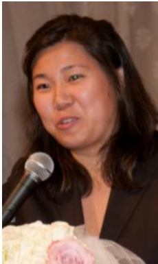
Grace Meng Assemblywoman 22nd District Queens